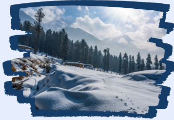
Jammu & Kashmir