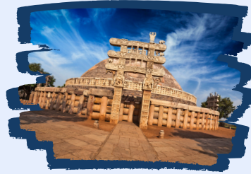
Jammu & Kashmir