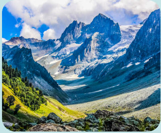
Jammu - Kashmir