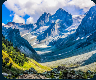
Jammu - Kashmir